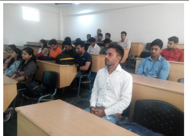
Students during the session